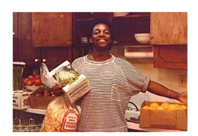
Hinton discovered Price Club!