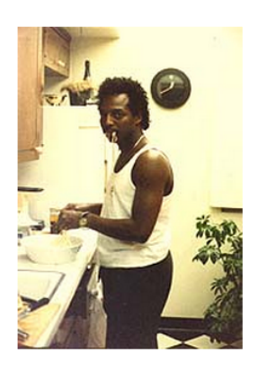
Sorry, Battleman, I couldn't resist